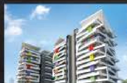
LANDMARK GREEN COUNTY BOLAR