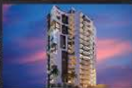
LANDMARK GRAND CITY PANDESHWAR