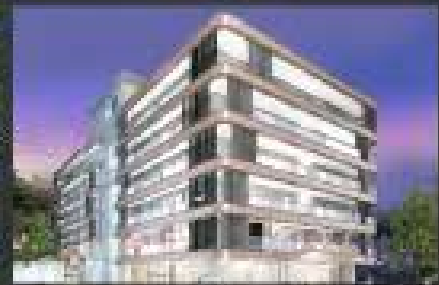
LANDMARK AYUSH HIGHLAND