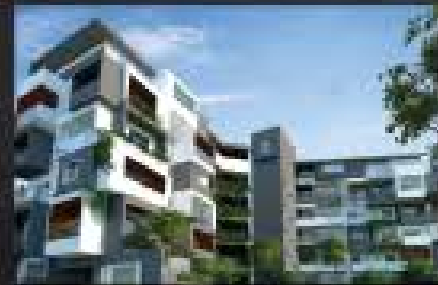
LANDMARK OXYGEN THOKKOTTU