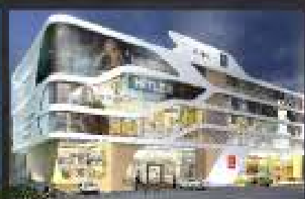
LANDMARK PHOENIX BALMATTA