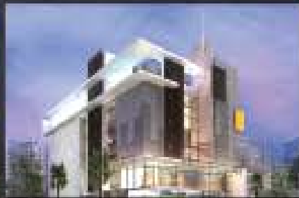
FALNIR HEALTH CENTRE FALNIR